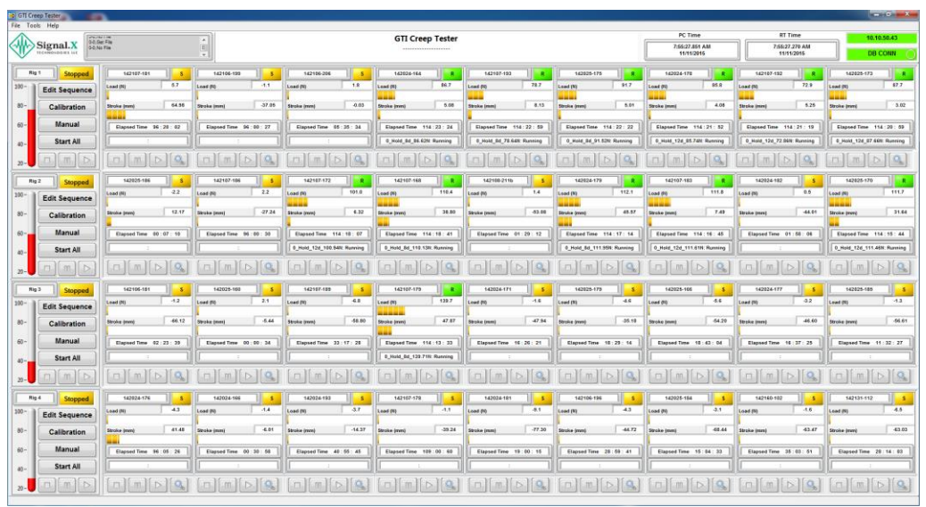
Figure 3: Main PC interface

15800 CENTENNIAL DR., STE. A NORTHVILLE, MI 48168 WWW.SIGNALXTECH.COM