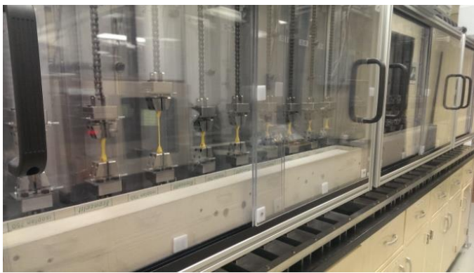
Figure 5: Creep tester samples on test

for those materials. The combination of LabVIEW, Real-Time and FPGA supported a reliable, flexible and effective development process.