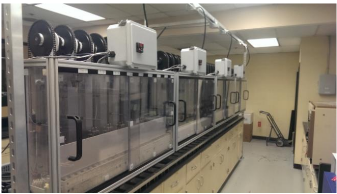
Figure 6: All four chambers of the creep tester